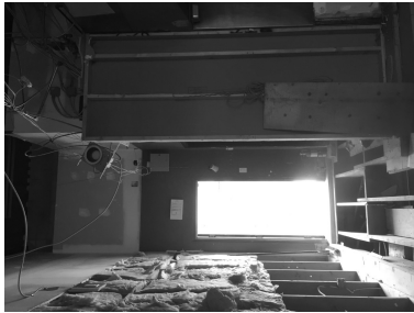
rear entry to unit 1532