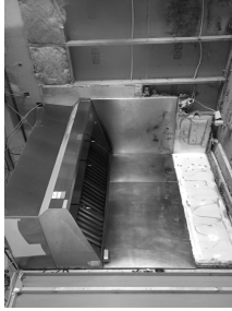
commercial exhaust hood